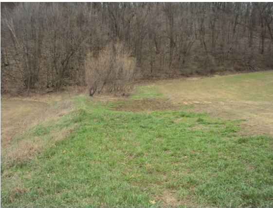
Water check mid-point in valley