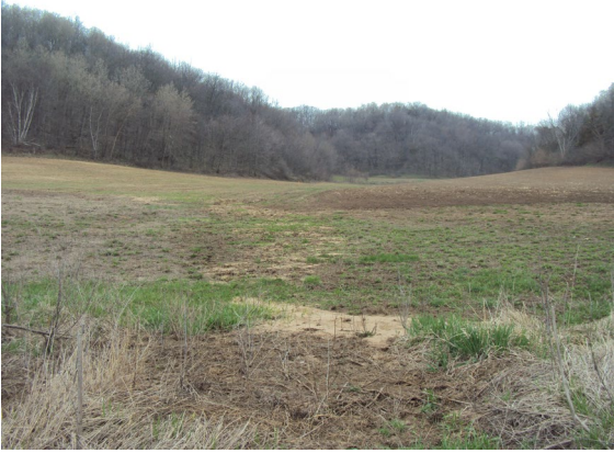
view into valley