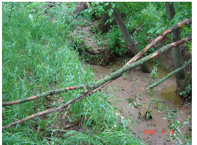
4. Erosion, destruction of vegetation.