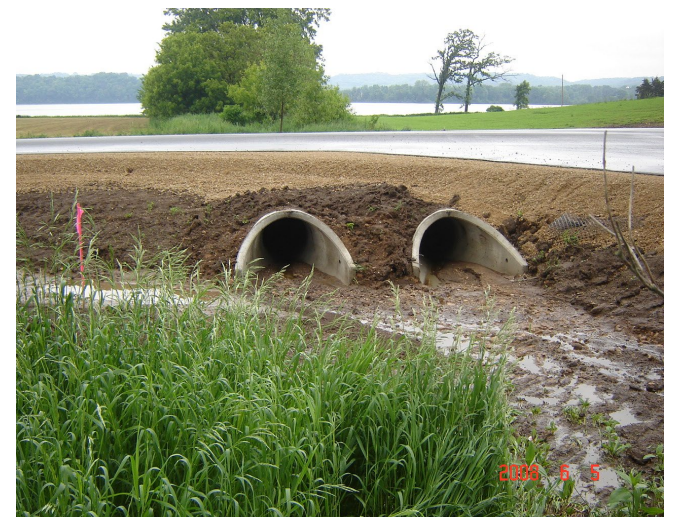
6. Looking north from NE corner of parcel.