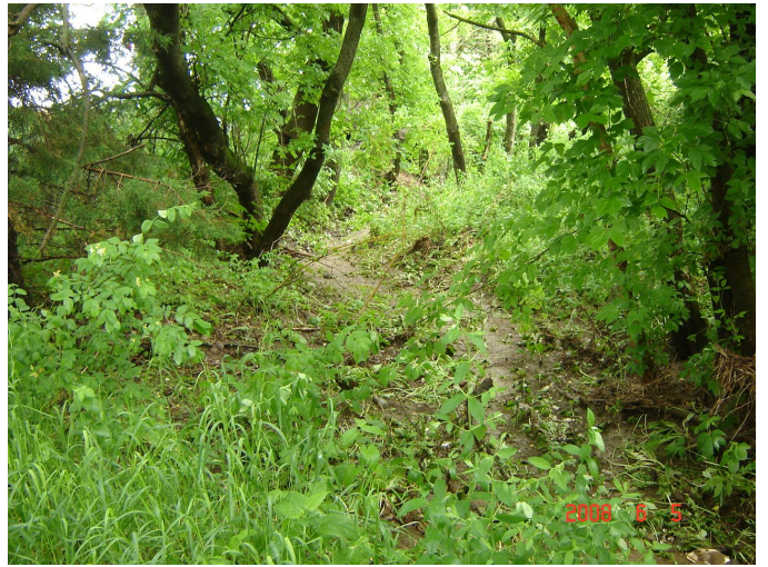
2. Water way with defined bed and banks.