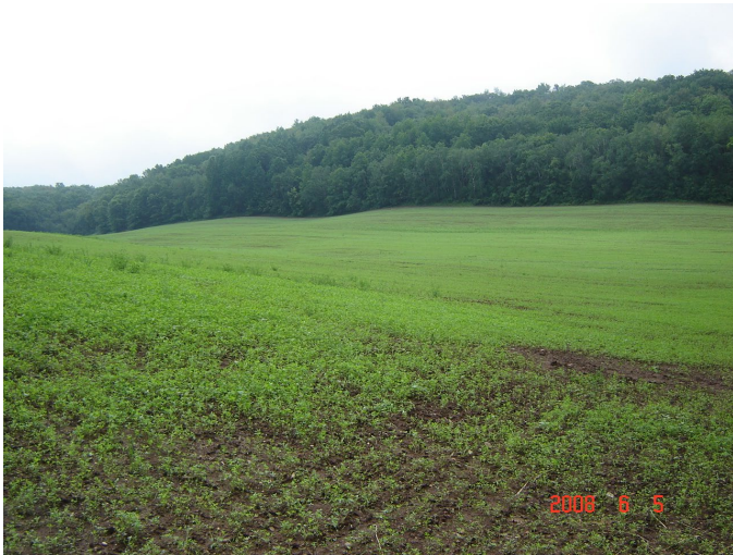
1. Ag field southeast of subject parcel.