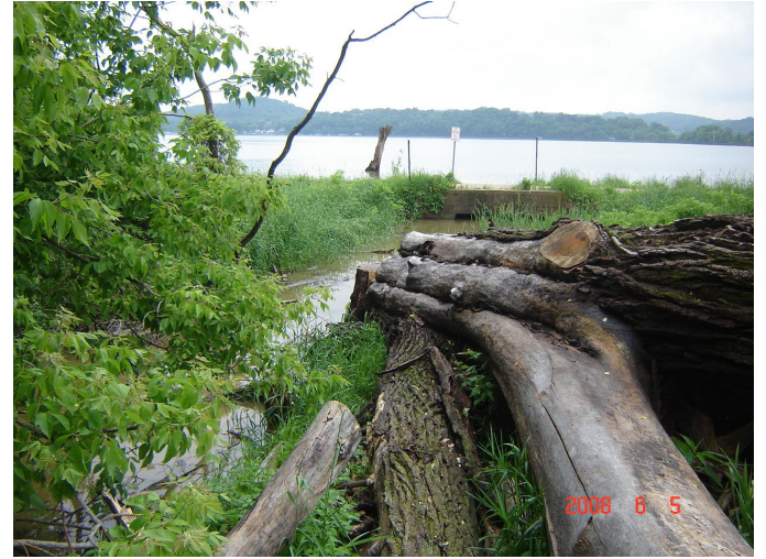
8. Looking north towards Crystal Lake (box culvert).