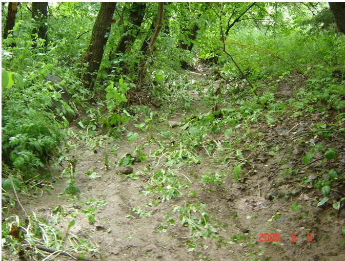
3. Water way along the east property line of parcel.