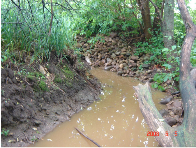
7. North of Emerald Ter. And south of Crystal Lake.